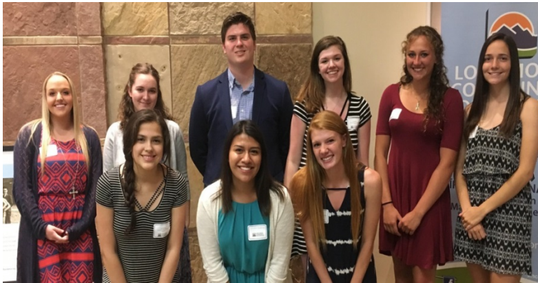
Scholarship recipients at the Scholarship Celebration event

We are very grateful for each and every gift we received to help the next generation succeed in their chosen college and vocational careers. Our goal is to create an endowment of $1 million so that we can continue to offer scholarships far into the future. If you are interested in helping local students, please consider making a one-time donation or leaving Ascend St. Vrain in your will or estate plans. Thank you!